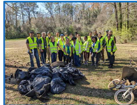
Creek Week Clean-up Event