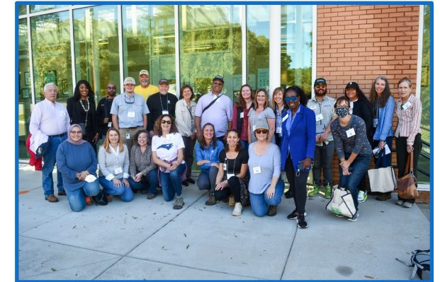
Farm Tour for Durham Leadership