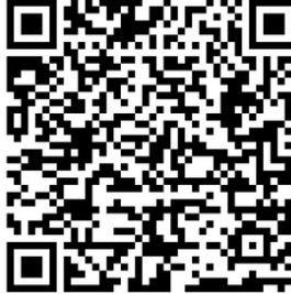
Voluntary Ag. District Brochure