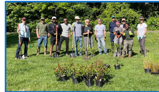
Rain Garden Installation in Neighborhood