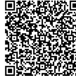
Ag Cost Share Webpage