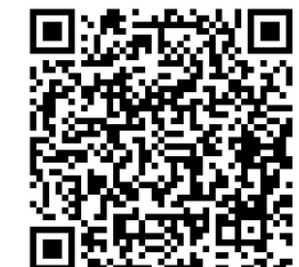
Ag. Cost Share Brochure