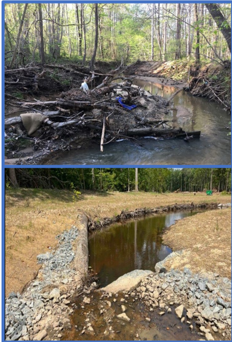
Stream Restoration (before on top and after below)

We are very involved with the Durham Community. If you have any needs or requests please reach out to us. 919-560-0558