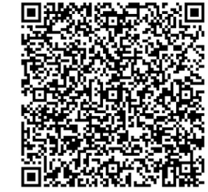
Voluntary Nutrient Reduction Program Brochure