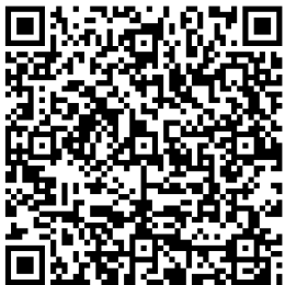
Stream Restoration Webpage