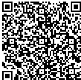
Farmland Protection Board Webpage