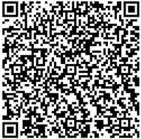
Ag Economic Development Webpage