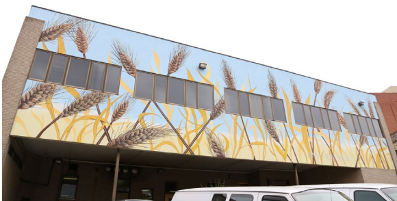
UNTITLED (NINTH ST. BAKERY) 2017

Major was cast in bronze and created from start to finish in Durham at Liberty Arts, a Studio and Foundry dedicated to enriching our communities with arts experiences that inspire, empower, educate, and entertain. The sculpture and plaza were gifted through a grant by The Central Carolina Bank to the citizens of Durham.