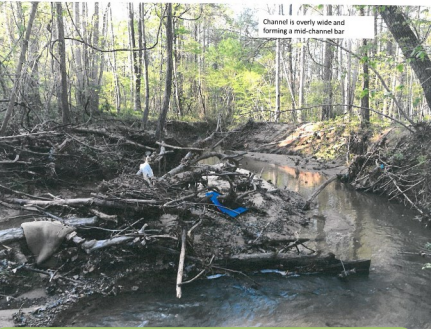
Existing conditions of stream

stream's watershed threatens to worsen sediment pollution in Falls Lake. Falls Lake is listed on the State's Clean Water Act Section 303(d) list of impaired waters. Due to the $1.4 million estimated cost, the project has been broken down as Phase I and Phase II. Thus far, the District has received a DWR grant along with Grove Park HOA funds and has submitted applications to UNCWI and CWMTF.