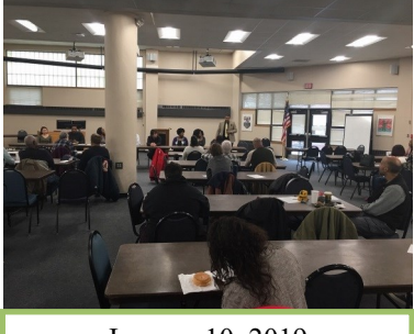
January 10, 2019