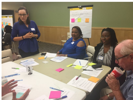
Community conversation at North Regional Library, September 27, 2018

The Committee began its work well aware of long-standing support for and opposition to Durham's Confederate monument; the controversy surrounding how protestors pulled it down; and the state and national debate over how these monuments were erected and what they mean. While our efforts are clearly informed by these elements, we strove to keep our meetings and discussions with the public