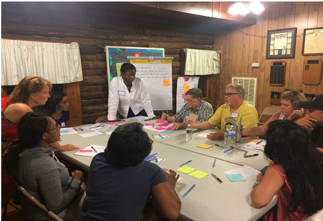
Community conversation in the Rougemont Ruritan Club, September 5, 2018