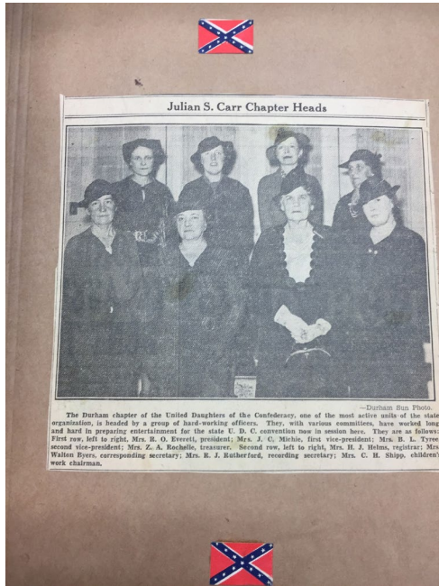
Page from a 1938 scrapbook of the Julian S. Carr chapter of the UDC, North Carolina Collection, Durham Public Library

At the 1913 dedication of the Confederate Monument at Chapel Hill known as "Silent Sam," Carr recounted how he had "horse-whipped" an African-American woman "until her skirts hung in shreds, because upon the streets of this quiet village she had publicly insulted and maligned a Southern lady." 7