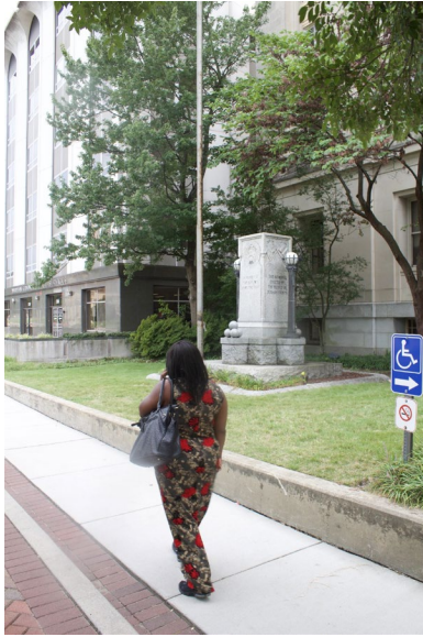
Durham Confederate monument base September 2017

recommendations to help guide our elected officials as we move forward. In executing our charge, we strove to be both historically informed and forward-looking.