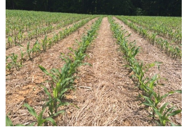
Long term no-till

• 2 Livestock Exclusion Systems to permanently keep livestock out of surface waters on the farm, thereby preventing soil erosion, sedimentation, pathogen contamination, and pollution from dissolved, particulate and sediment-attached substances entering the waters and impacting water quality downstream. Both systems including fencing and alternate watering sources