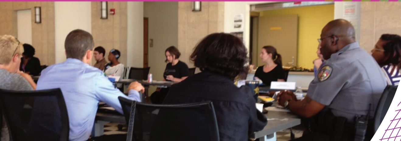
Image above: JCPC members are appointed by the Board of County Commissioners representing state and local agencies and service providers. The monthly meetings are open to the public.