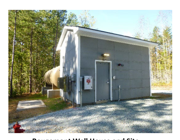
Rougemont Well House and Site Water System Number NC4032018